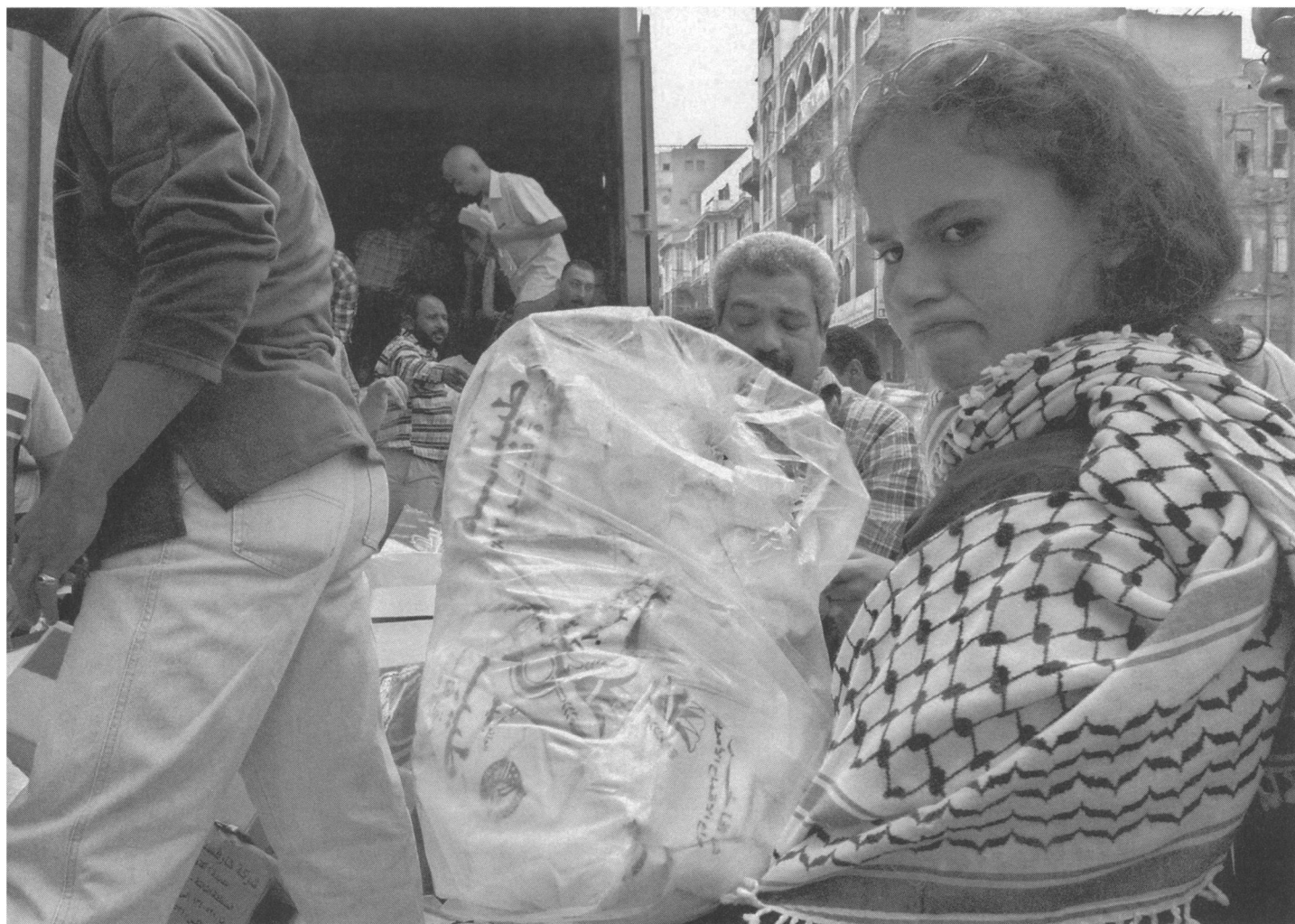
American University in Cairo students pack truck of relief supplies headed for Gaza.