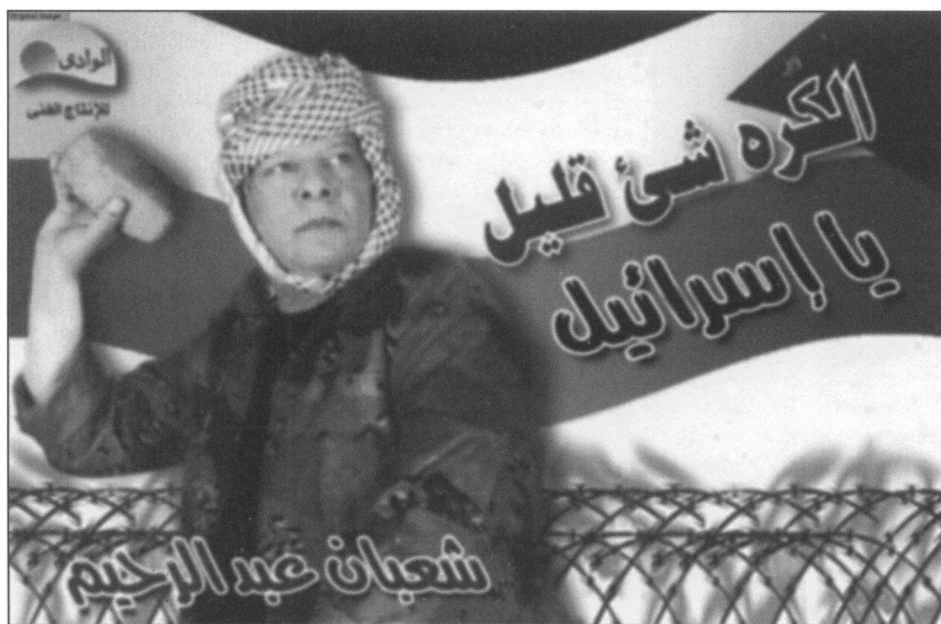
Cover of Shaaban Abd al-Rahim's newest tape: "Hate Is a Trivial Thing, Israel!"

Recent Egyptian videos, films and advertising also offer little but mercenary stereotypes of Palestinian struggle. For the most part, the commercial purpose of these images undermines their intended dramatic effect. The picture of Muhammad al-Durra, a young boy killed in October 2000 by Israeli gunfire, has appeared in countless music videos and on T-shirts and boxes of Kleenex. Images of raised guns, the Dome of the Rock and Palestinian flags incongruously adorn cassette tapes of pop stars who sing about love. Most famous has been the appearance of Abu Ammar corn snacks, featuring a cartoon of a confused-looking Yasser Arafat. Such images have begun